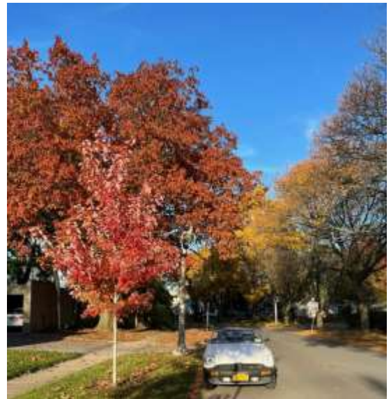
Janet & Klint LiMuti's MGB with trees with splendid fall color

Destination #13 Horses in Field, #32 Historical Place/Site, #37 Very Curvy Road and #46 Old Cemetery established before 1900 had the greatest number of participants complete with thirteen. Destinations #2 Easter Decorations, #3 April Showers, and #35 Car in a Parade had the lowest number of participants to complete with only five.