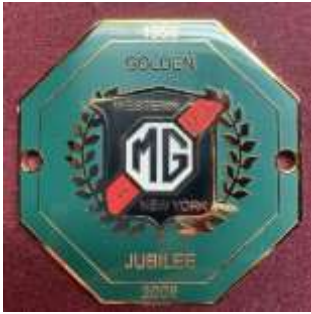
50 th Ann. Badge $20.00