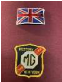
Embroidered patches $2.50