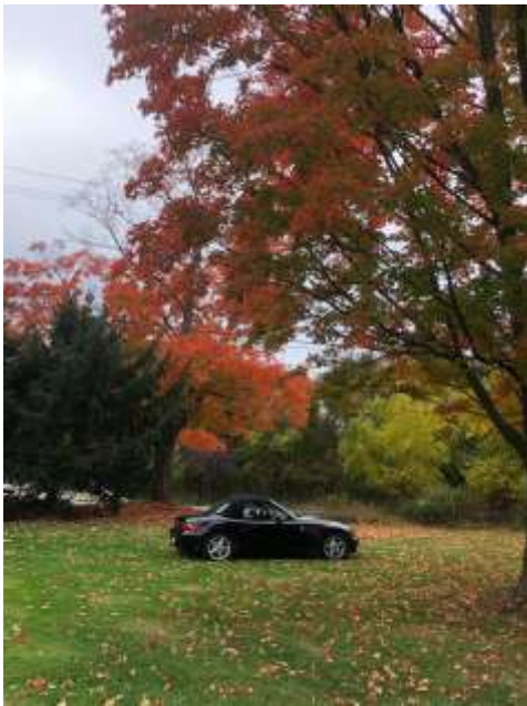
Lane Boughton's BMW with trees with splendid fall color