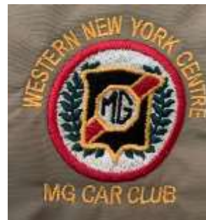
Closeup of Actual Embroidery of Logo

Color Choice: Not all colors may be available do to supply chain shortages. Feel Free in emailing me if you have a color you want me to check on at blitz7711@gmail.com