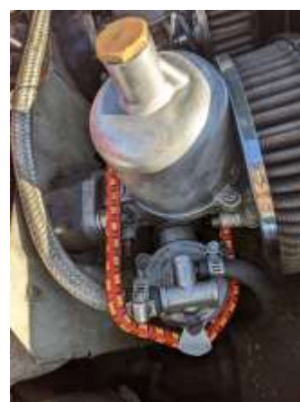
"some... ingenuity with a bungee cord"