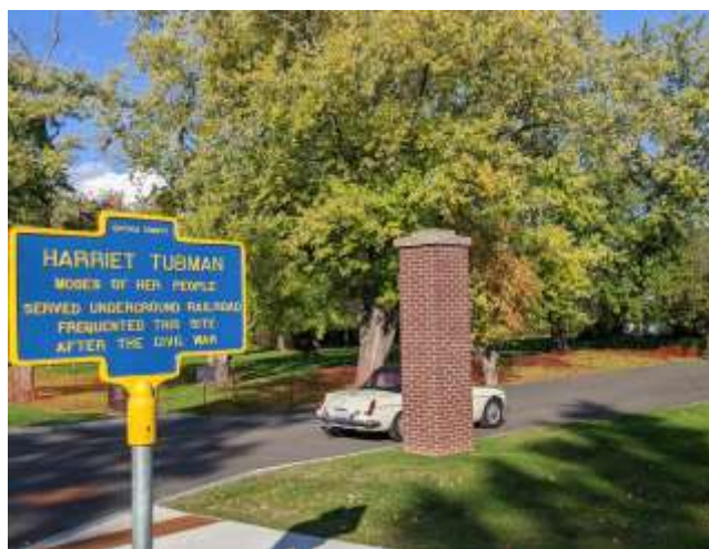
The Krays visited the site of Harriet Tubman's House in their MGB