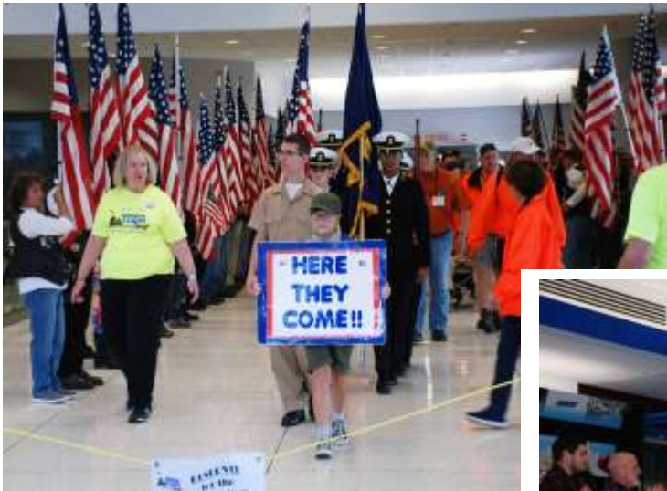
Start of the line coming off the plane