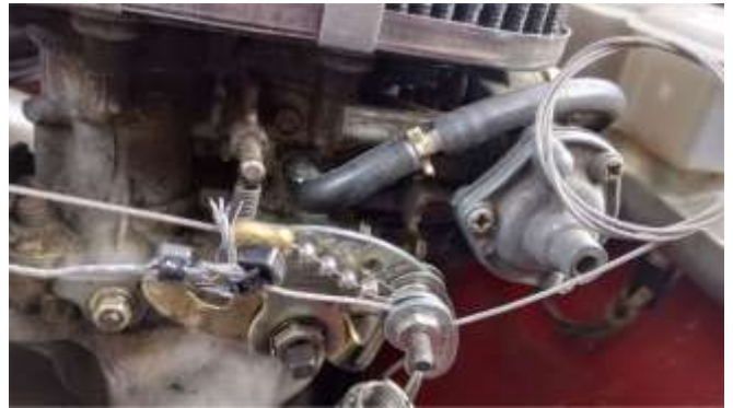
Up front, my broken throttle cable spliced together to a scrap of spare cable – tied in a square knot and secured with two tie-wraps. This did the trick until I could get to a parts store. (The second cable with the small chain is from the cruise-control module.)

And speaking of things unexpected , besides a bad fuse, Susan and I had just one breakage requiring a repair during our recent cross-country MGB drive with the Zaks. My throttle cable broke one morning in Spokane, Washington. For a month-long trip of 7,574 miles in a forty-four year-old MGB, I have to say our great fortune was a bit unexpected ! Oh, and for those of you