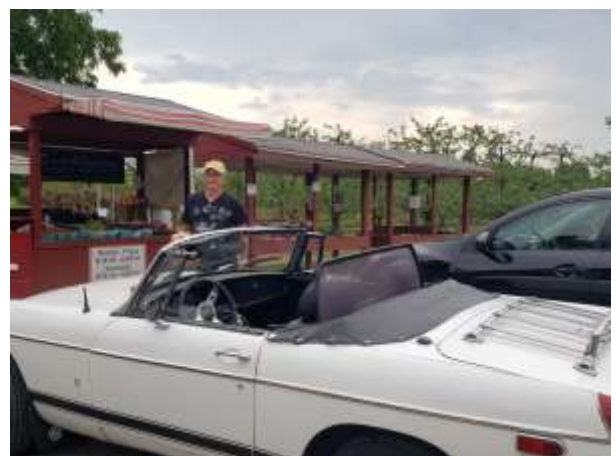
The LiMutis' MGB at apple orchard with farm stand