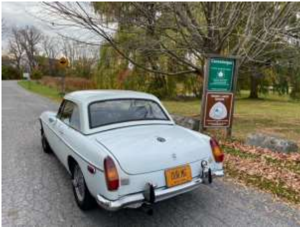
George Heissenberger's MGB at a NY State Park or Site with a Sign (Canandaigua State Marine Park)

We had ten participants complete destination #21, Coffee Shop with Sign. Eight of the ten coffee shop pictures were from our own Cars and Coffee hangout, Freestyle Mercantile.