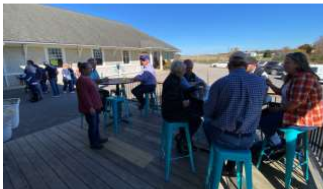
Enjoying the shade at the brewery