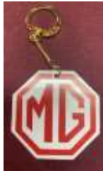
Octagon Key Ring $1.50