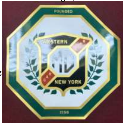
10" Magnetic Sign $15.00