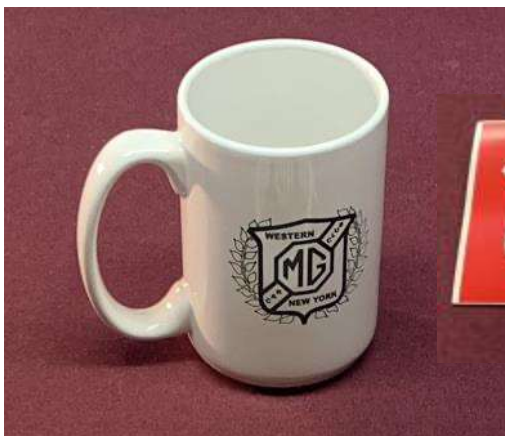
Coffee Mug $5.00