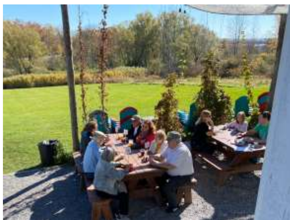
Enjoying the sunshine at the brewery

altered when it turned out to be an unpaved dirt road. I did make a few other route changes to take advantage of some scenic views, and a couple on intersections I felt were too hazardous, even with newer cars. Of course, two weeks before the event I discovered that two of the roads were closed, however I was assured by the Town of Bloomfield Highway Supervisor that the closures were temporary, and the roads would be reopened in plenty of time. Sure enough, they were but there were three spots we had to go over slowly where culverts were placed across the road. The weather forecast (three different ones, no less!) also decided to