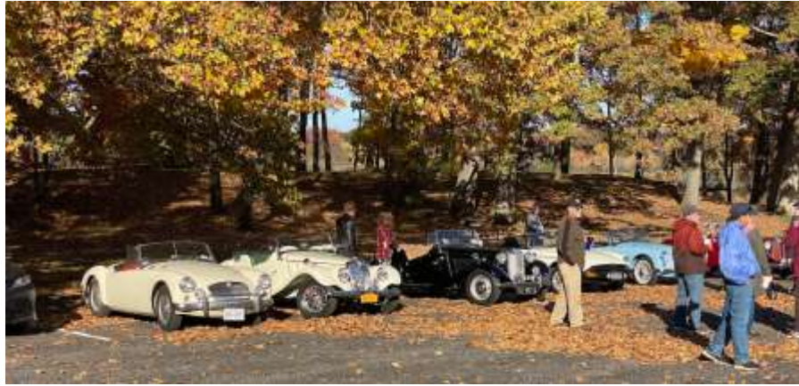
Cars and drivers gathering at Mendon Ponds for the start