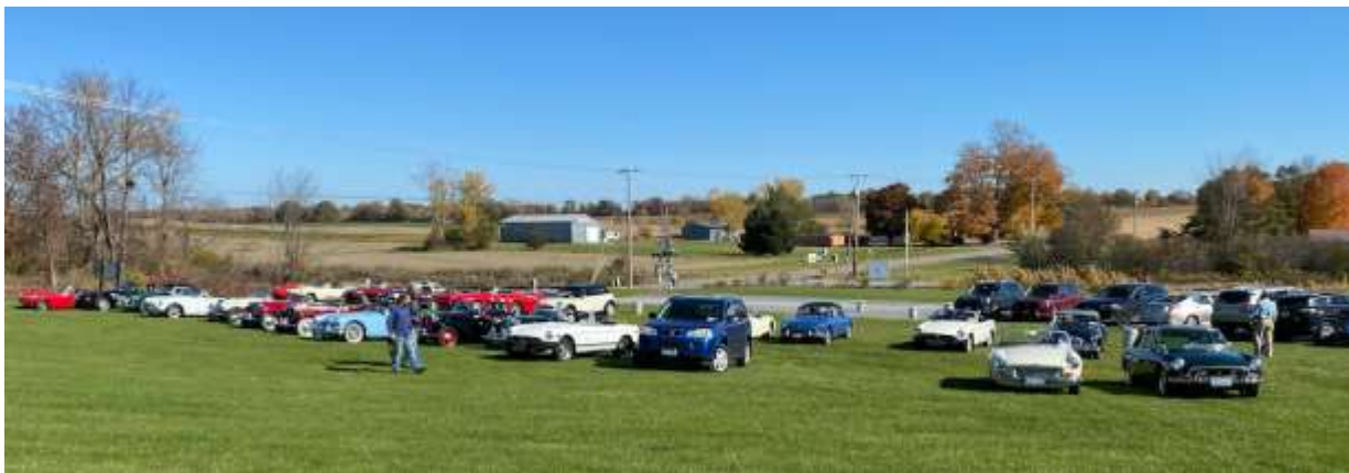
Cars parked for the lunch stop at Rising Storm Brewery

altered when it turned out to be an unpaved dirt road. I did make a few other route changes to take advantage of some scenic views, and a couple on intersections I felt were too hazardous, even with newer cars. Of course, two weeks before the event I discovered that two of the roads were closed, however I was assured by the Town of Bloomfield Highway Supervisor that the closures were temporary, and the roads would be reopened in plenty of time. Sure enough, they were but there were three spots we had to go over slowly where culverts were placed across the road. The weather forecast (three different ones, no less!) also decided to