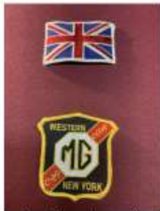
Embroidered patches $2.50