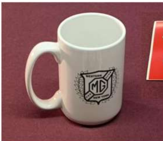
Coffee Mug $5.00