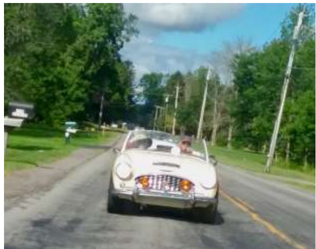
The Stepaniks