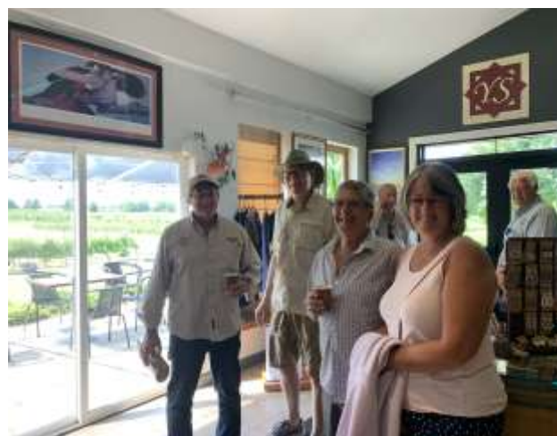
At Young Sommer Winery