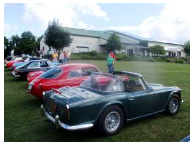
At the Winery Stop by R. Powers