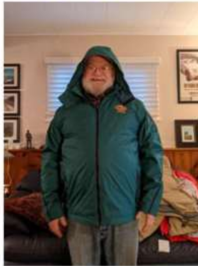
Team 365 Tag RN108030 / CA 05155