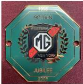
50 th Ann. Badge $20.00