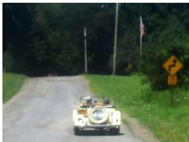
The Blacks' TD by R. Powers