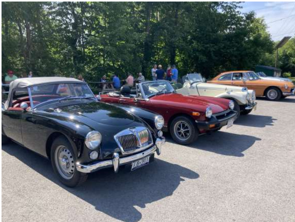
Cars & Coffee in Mumford, NY on July 31, 2022

Around 12 cars were there and "it was a nice relaxed time visiting with club members."