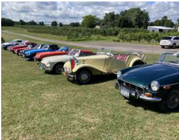
Winery Stop