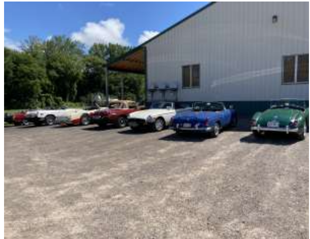
Winery Stop