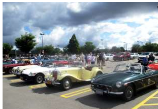
Before the Start by R. Powers