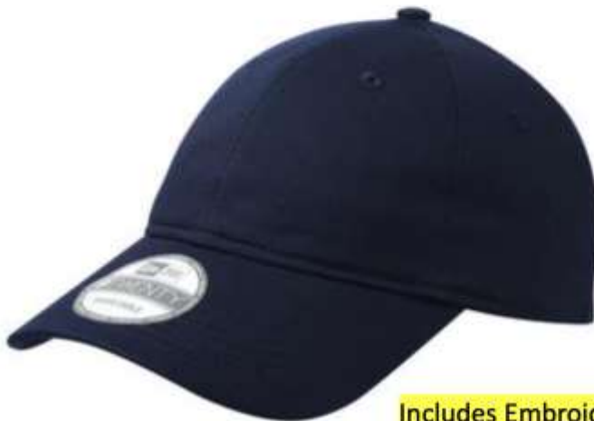
NE201 New Era® - Adjustable Unstructured Cap.

(price will go down if we order over a dozen)