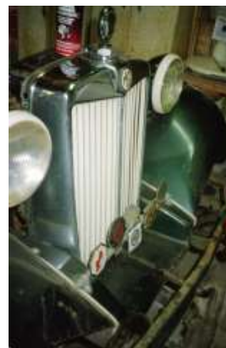
Wild TD – during refurbishment work with MGCC

This article doesn't capture all the active TDs in our club's history. A few others are worth a mention: