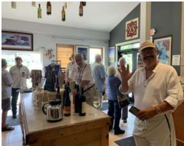
At Young Sommer Winery