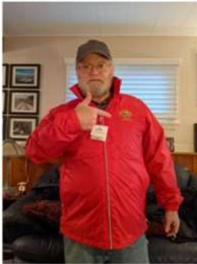
Tri-Mountain Performance W/ mesh lining & hood Tag: RN 88051