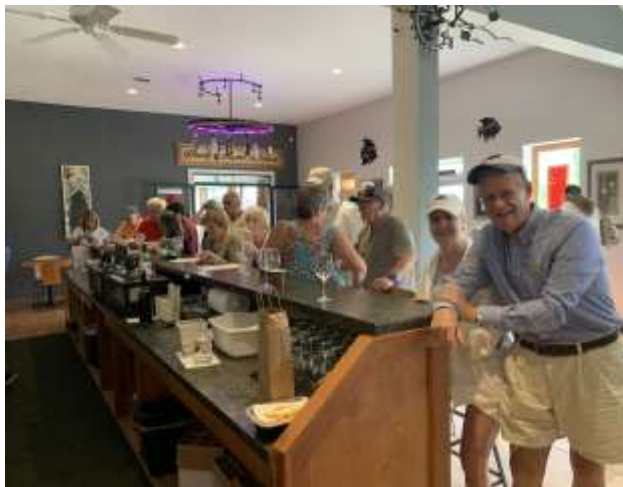
At Young Sommer Winery