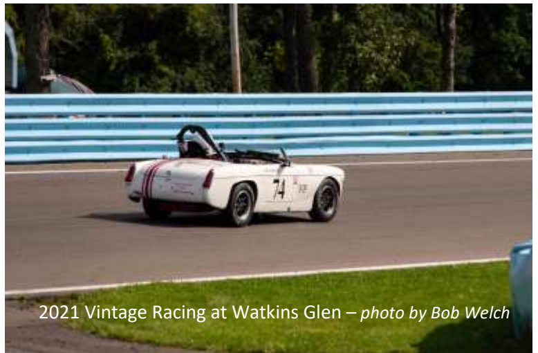
2021 Vintage Racing at Watkins Glen

This leaves the elected positions, as established by our by-laws, of Vice Chairperson, Secretary, Treasurer and Activities Director open for new candidates. Please consider serving your club in one of these capacities. All of these jobs are fun and won't take up too much of your time. A special note to our new members : you are not too new to be elected to a position on the board! In fact, we would welcome some new folks, with new ideas, into leadership positions. I'd only been a member for about six months when I was elected Chair the first time and I wasn't run out of town in the aftermath! Think about it.