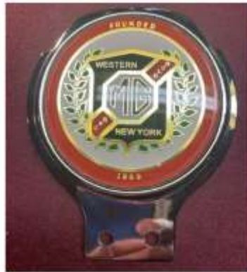
Car Badge $20.00