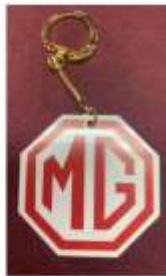
Octagon Key Ring $1.50