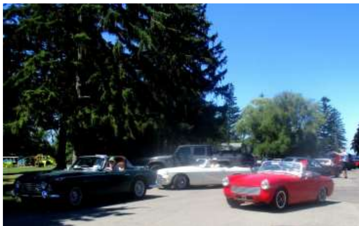
Bumper Cars? by R. Powers