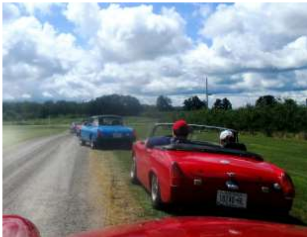
Leaving the Winery by R. Powers