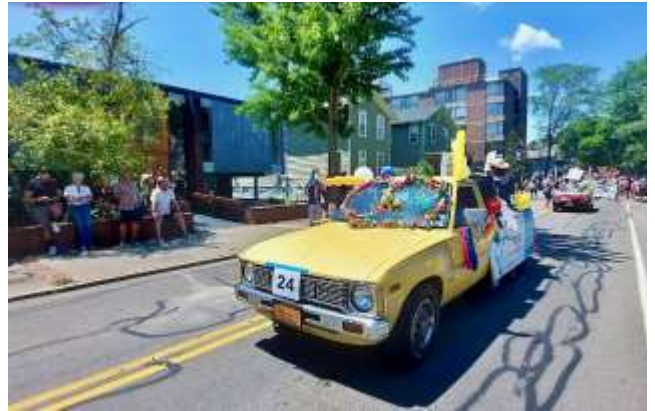
Barb & Leon Zak's '81 Toyota "Sport" Truck at #35 – Your Car in a Parade