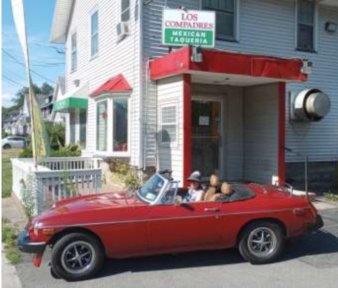
The Goodwins' '78 MGB at #19 – an Ethnic Restaurant