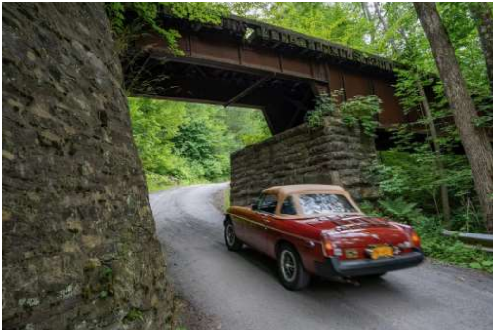
Pine Hill, NY Railroad Bridge

Safety Fast!! (and be extra careful when zooming under narrow railroad bridges with stone abutments around curves where you can't see far ahead)