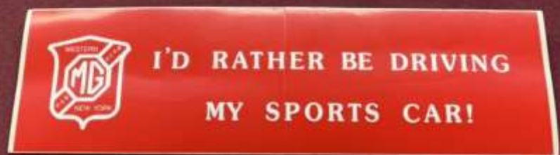
Bumper Sticker $1.00 / 3 for $2.00

In between meetings feel free contacting Joe B at blitz7711@gmail.com