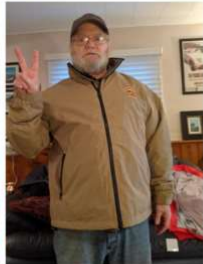
Tri-Mountain W/ fleece lining & no hood Tag: RN 88051365