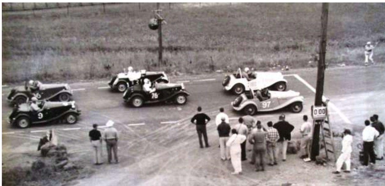
Wild TD - number 3 on grid at WNYMGCC All MG Races with others