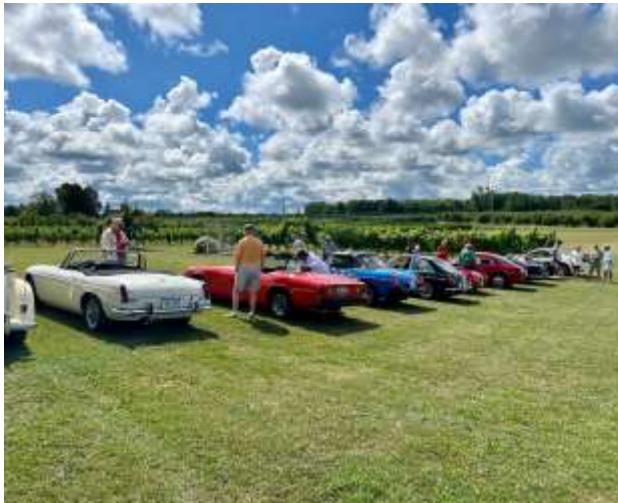
Winery Stop