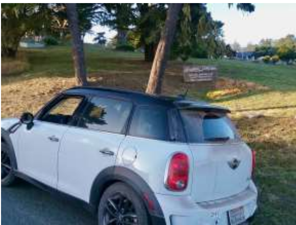
Susan Goodwin's 2013 Mini Cooper S at # 46 – Old Cemetery – BONUS! Established pre-1900 (this one dates from 1863)