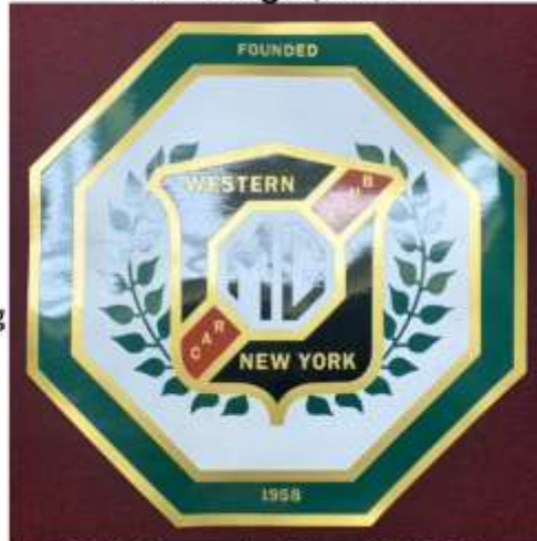
10" Magnetic Sign $15.00