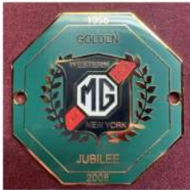
50 th Ann. Badge $20.00