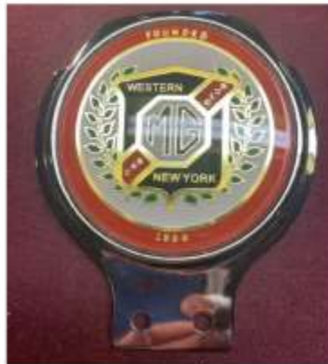
Car Badge $20.00