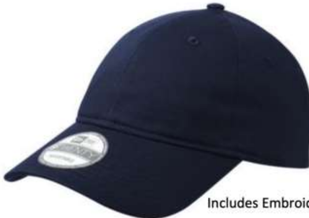
Includes Embroidery: $25.

(price will go down if we order over a dozen)