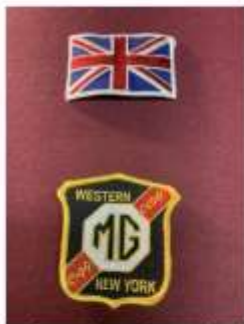
Embroidered patches $2.50