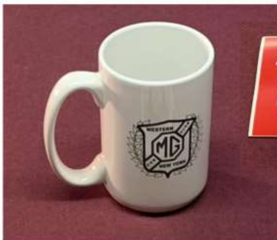
Coffee Mug $5.00