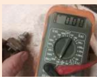
"...zero resistance when plunger is released..."