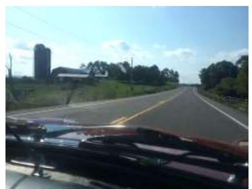
passing farms along the way