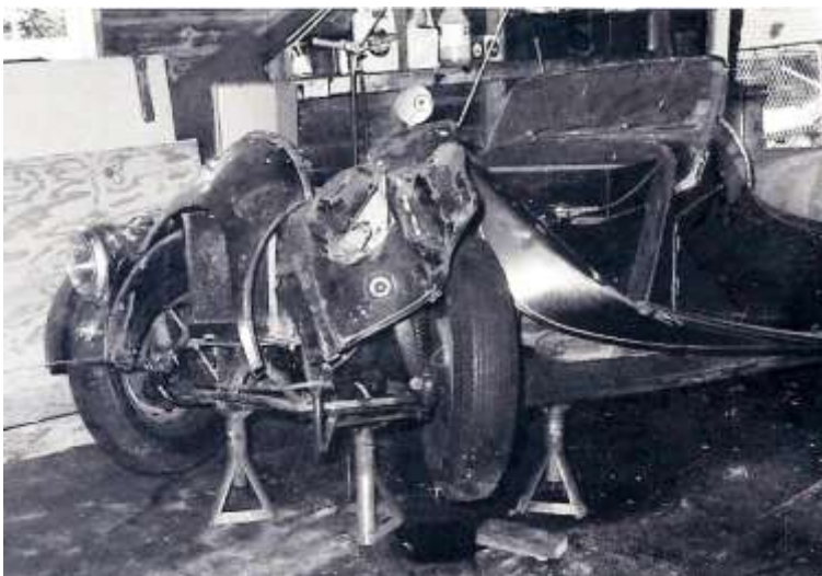
My Morgan after accident 8-28-78