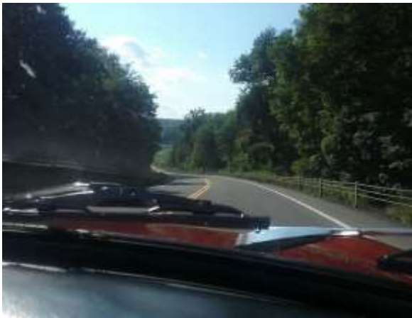
"...driving...on winding, hilly, curvy roads..."

Our travels continued to Watkins Glen where we stopped for coffee to help keep us awake after all that wine. Our journey continued up the west side of Seneca Lake until we turned west and headed toward Penn Yan and then over Naples way. Driving in the country on winding, hilly, curvy roads we passed towns and farms, farm-stands, Amish