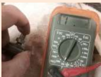
"...look for infinite resistance when plunger is depressed..."

Part 6: Reseal the switch with JB Weld, because you want this fix to be permanent, even though you have already ordered a new switch. Reinstall the switch in the car and get your lovely assistant to take a picture while you step on the brake pedal. Breathe easy – you have an MGB and a lovely assistant. What could be better? MG