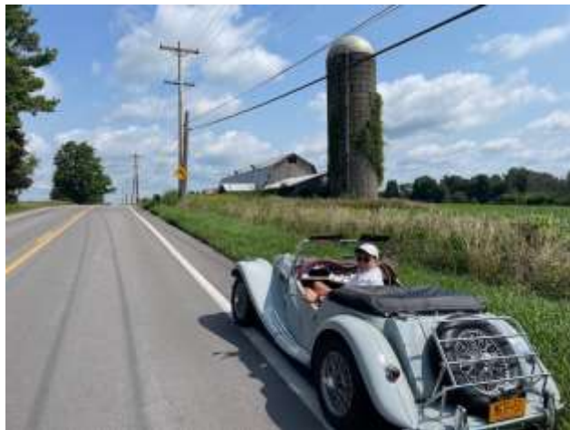
2021-02 Marlene Rzepkowski in the TF at a barn with a silo

More select photos by contest participants