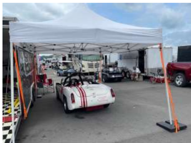
2021-11 Dick Rzepkowski's race car, outside NY State