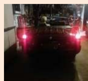
"...get your lovely assistant to take a picture..."