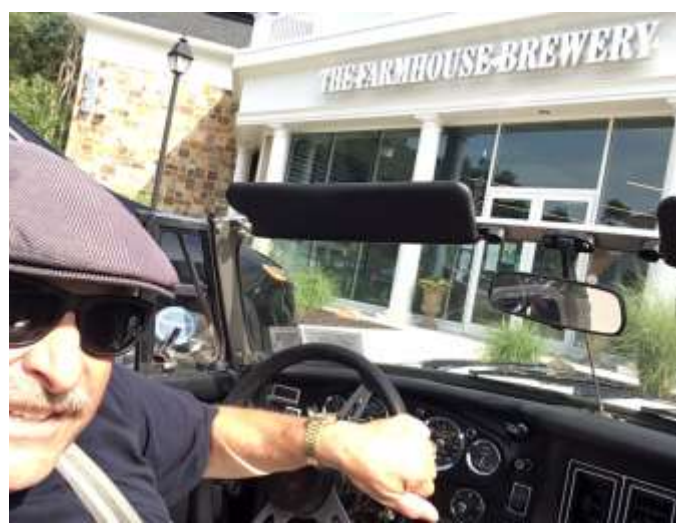
"I have been driving the MG a lot..." GH

wrong with the old one, but I felt it was time just for preventative maintenance. I'm glad I did, since the old battery had started to corrode at the positive terminal, and I ended up having to replace the terminal with a new one when I changed out the battery. I think I