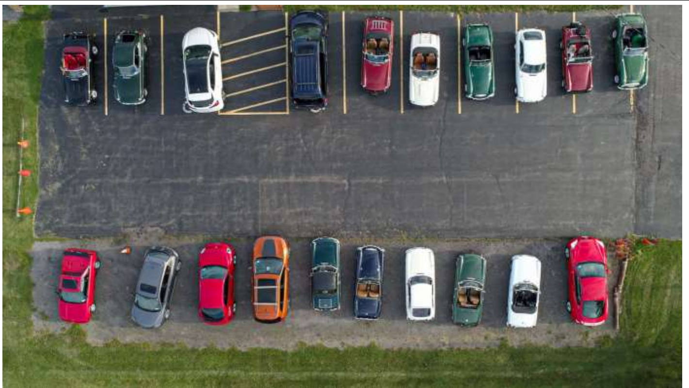
Above: Cars in attendance at the August 19 MGCC Picnic Meeting