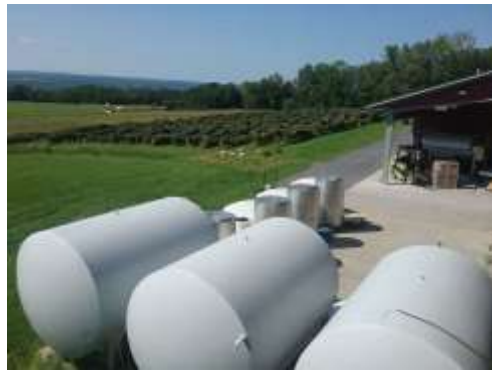
at Red Newt Cellars Winery

August 24 th was a beautiful day for a two-hundred-mile drive in the Finger Lakes. The impromptu drive that was put out on the MG Car Club email list the day before, would start at the meet-up spot, the