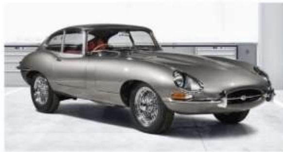
Celebrating the Jaguar E-Type