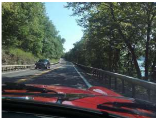
"Our travels continued..."

testing connections and bulbs, the brake lights still did not work. The brake light switch was malfunctioning. So, what should we do? We decided to go on with our journey. The Goodwins would lead the way with the Zaks driving behind, anticipating when the Goodwins would brake and/or stop their car.