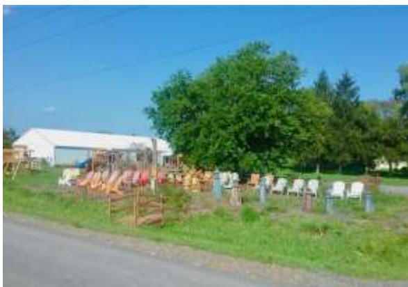
"...and many things for sale along the roadside."

towards Watkins Glen, we stopped for a charcuterie lunch at Red Newt Cellars Winery and drank some good wine.