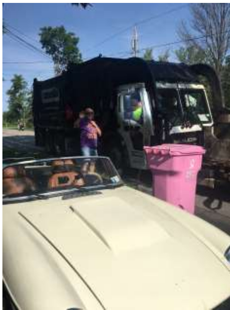
Leon & Barb Zak scored the maximum possible on this photo with the garbage truck. – Smile and wave!