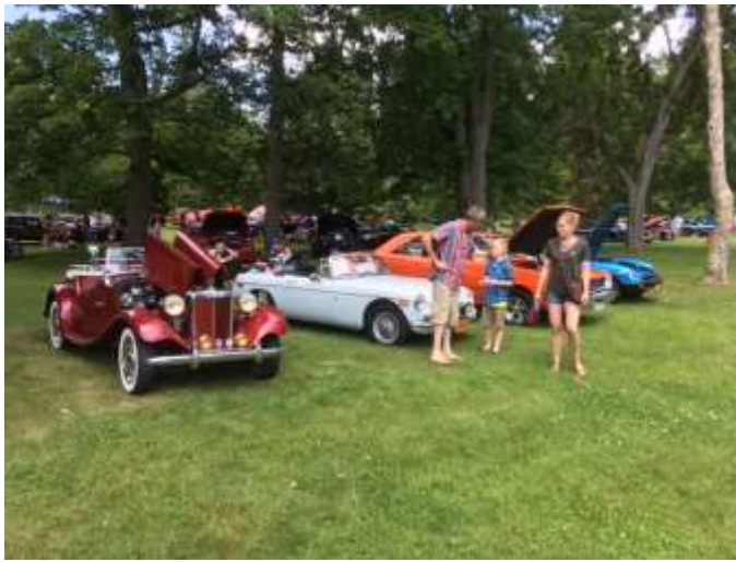
3 LBCs, including Heissenbergers' MGB