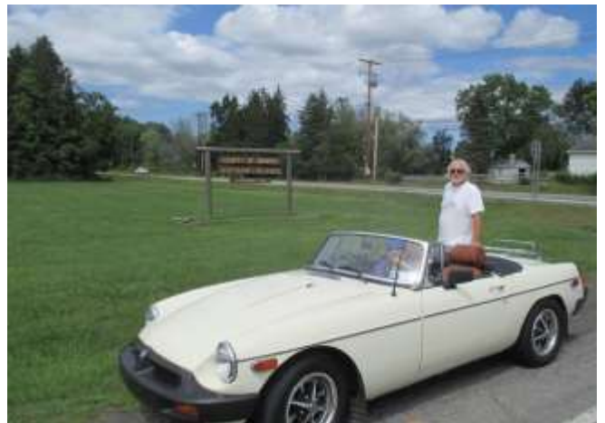
At Northampton, a Monroe County Park near Spencerport