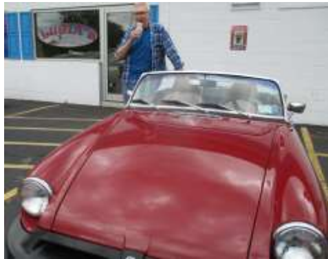
Eating more ice cream at Lugia's in Spencerport