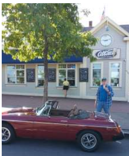
at the original Abbott's