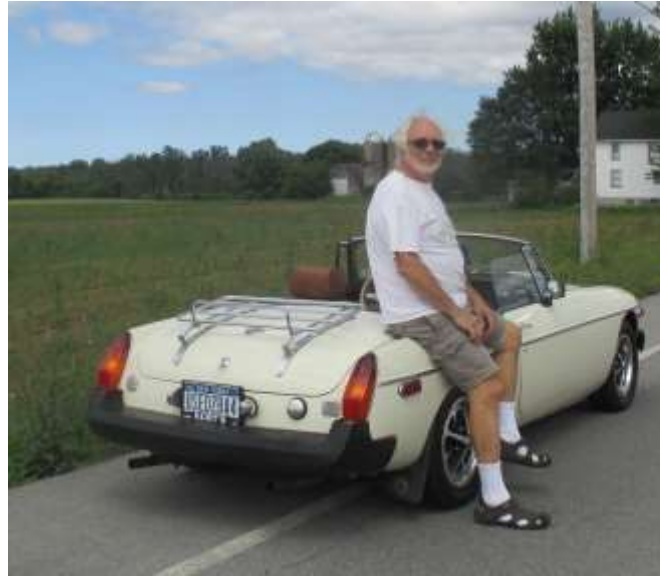
In the background, a barn with TWO silos (the second silo gets the Zaks a bonus of absolutely nothing)