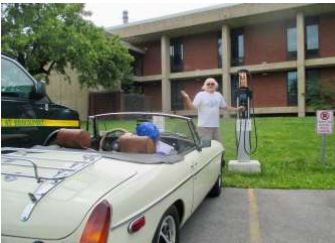
An electric car-charging station