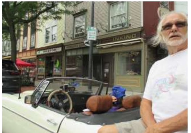
At Creative Inking tattoo parlor in Brockport, NY