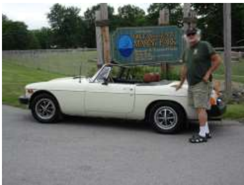
the Zaks found an Orleans County Park