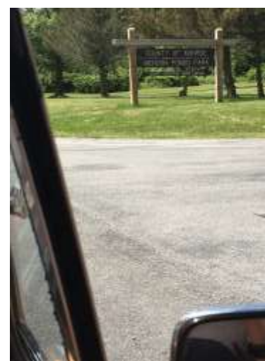
a bit of the Robinsons' MGB got just close enough to Mendon Ponds Park