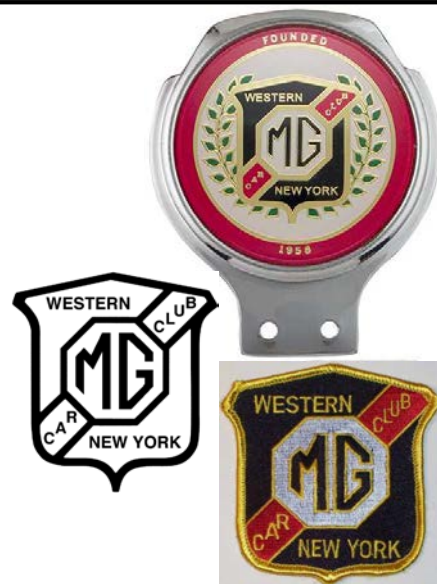
Sticker Car Badge Patch

Also available is a wide selection of clothing items (shirts, jackets, ect.) embroidered with the club logo. Prices shown are for members only. All items are available for purchase at our monthly