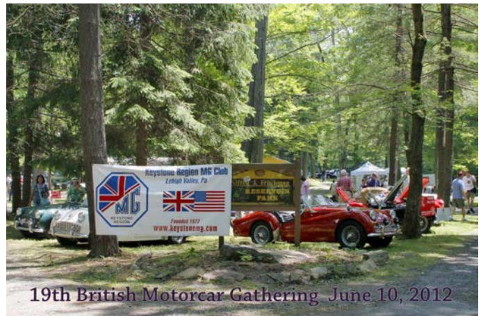
19th British Motorcar Gathering June 10, 2012

In addition to the car show and Historic Bethlehem, there is a lot to do while you are here including the America On Wheels car museum in Allentown http://www.americaonwheels.org , and The Martin Guitar Museum and Factory in Nazareth http://www.martinguitar.com , Yuengling, America's oldest brewery, http://www.yuengling.com , a very unique garden center, or just lovely roads to drive.