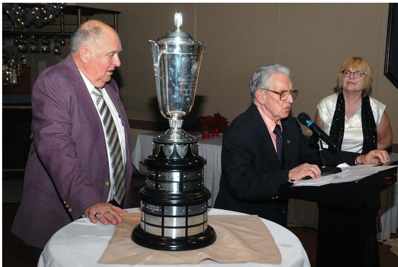
Great Get Together at the Holiday Party