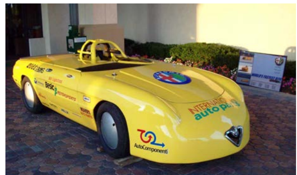
Worlds Fastest ALFA