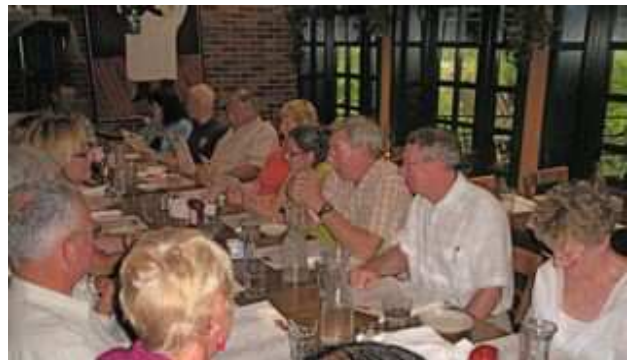
Dinner at Curley's

Sunday saw a few leave early for home while the remaining 5 cars traveled to Seneca Falls and enjoyed the Visitor Center at the Womens Rights National Park. After lunch at the Hotel Clarence we all headed home with good memories of another club event.