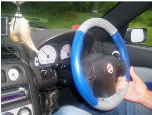
Al Wagner was checking out the Speedometer