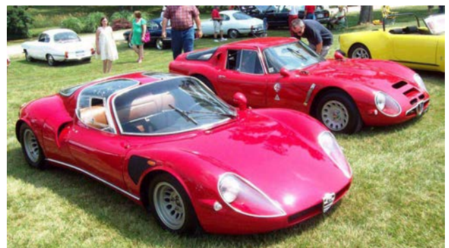
ALFA T33 Stradale & Giulia TZ