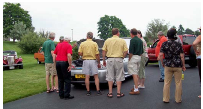
Checking out what we may have missed by not getting this car here