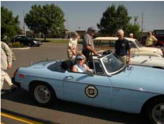
Start your engines

After a delicious lunch at the Sherwood Inn, we crossed the street to board the Barbara S. Wiles for a tour of the Lake and a few got caught in a torrential downpour.