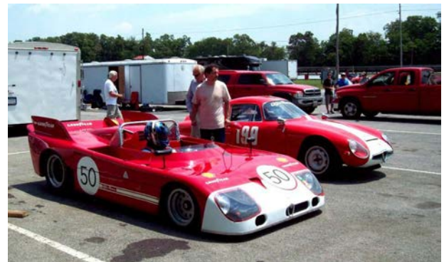
An ALFA T33-3 & Giulia GTZ