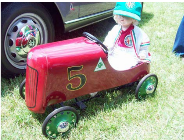
ALFA Pedal Car