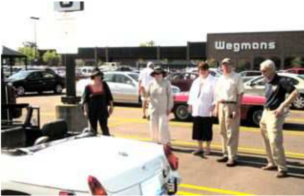
Ready to leave

Saturday was a beautiful day for the club tour to Skaneateles Lake and 21 members left Canandaigua for some country road driving in the sunshine.