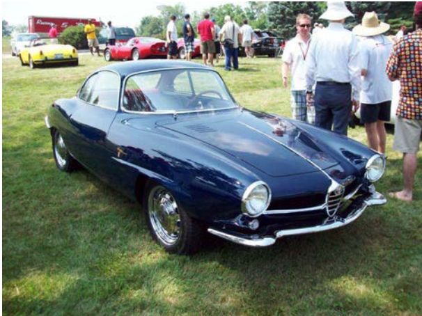
ALFA Sprint Special