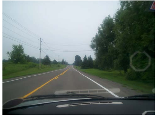
Imagine doing 80 down country roads around Victor