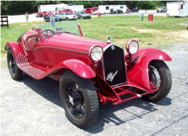
ALFA 8C 2300