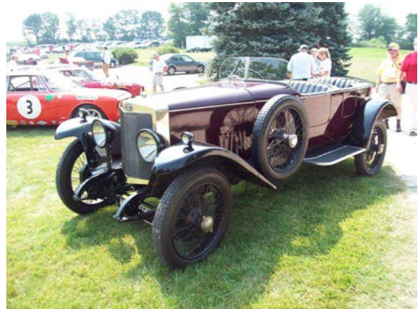
Oldest ALFA in the USA 1920 RL-33